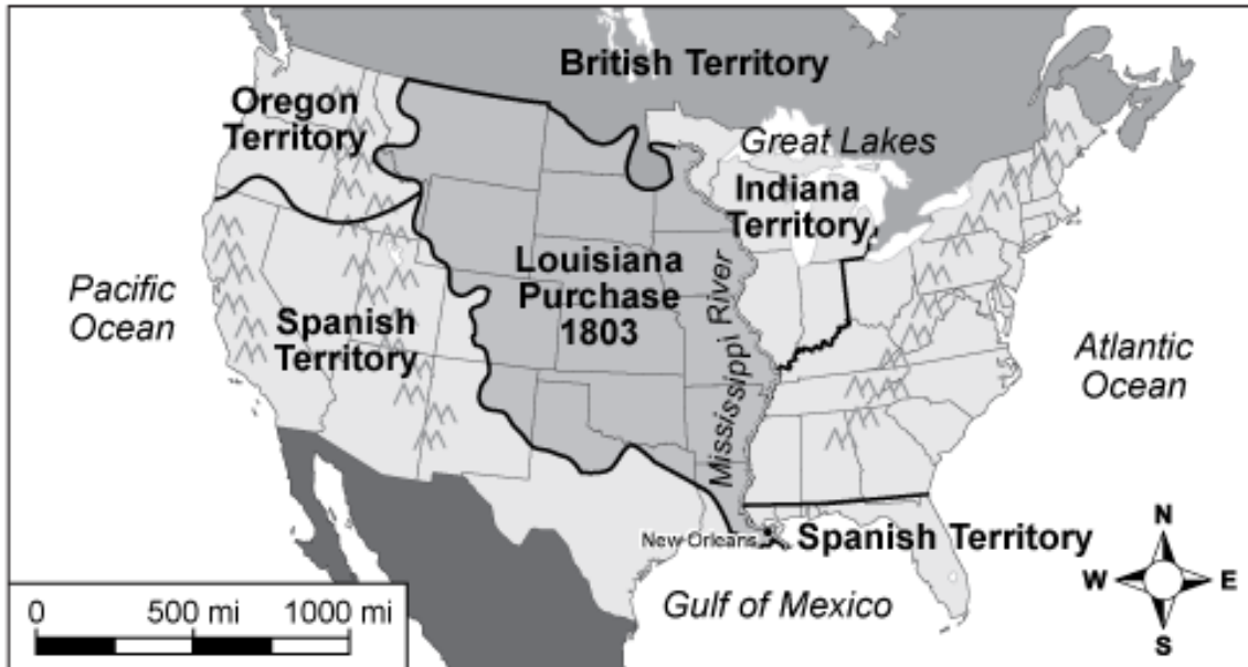
Louisiana Purchase Map