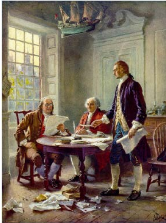
Source: Writing the Declaration of Independence, 1776. J.L.G. Ferris.

This picture shows Benjamin Franklin, John Adams, and Thomas Jefferson writing the Declaration of Independence in 1776. Thomas Jefferson wrote the Declaration of Independence with help from other members of the Continental Congress.