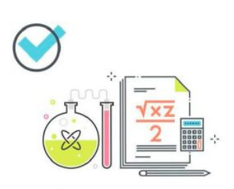
solve complex problems.