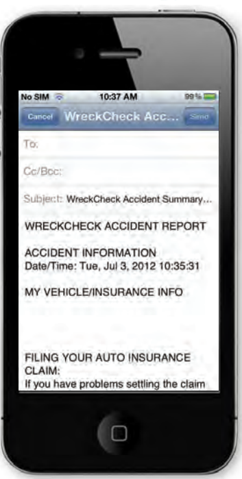
Send your completed report by email to yourself and/or to your agent.

See the tips section for information on filing a claim.