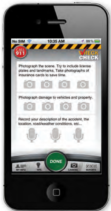
5. Tap "Photos & Recordings" to document the scene.

The app has placeholders for eight photos and three audio recordings to use when completing your report.