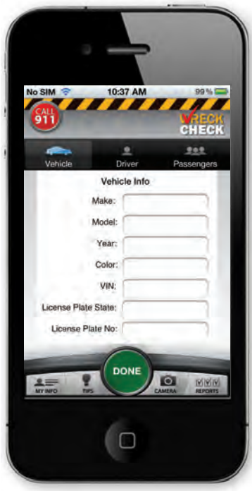
7. Tap "Vehicles, People & Police" to collect information about others involved in the accident.

If authorities are not dispatched to the scene, be sure to file an incident report.