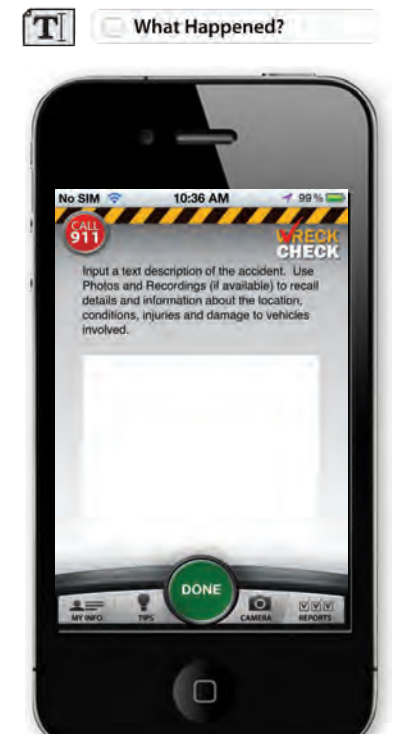
6. Tap "What Happened?" to input a text description of the accident.

The app has placeholders for eight photos and three audio recordings to use when completing your report.